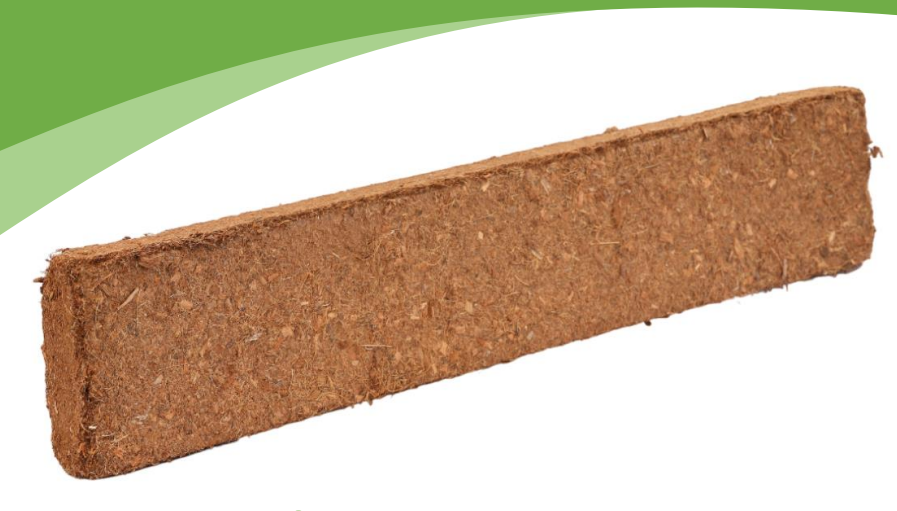
Coco Grow bags

COCO Grow bag is a natural product produced from coco peat. It is available in different sizes based on the plant's max. size. The slabs are usually covered with UV stabilized polythene bag. The UV bag prevents plant diseases & weed growth. A small opening will be made on the bag for implant & water irrigation at plant growing factory. The bags used to reduce the man power for installation & maintenance of plant growing at factories.